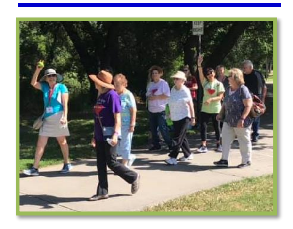
Funded by USDA SNAP-ED, an equal opportunity provider and employer.

ENCOURAGING OLDER ADULTS TO MAINTAIN GOOD HEALTH AND ACTIVE LIVES LONGER!