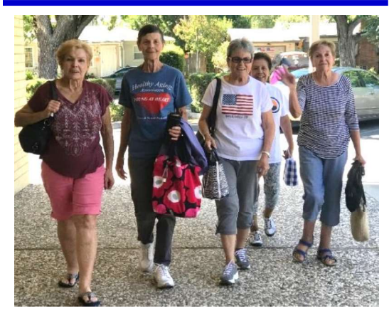
Funded by USDA SNAP-ED, an equal opportunity provider and employer and lender.